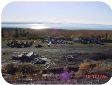
Pretty Salvage: Wastes are separated out at the Landfill

Finally, the community purchased a Canon 150 Glass Crusher , but has not started using it because they are waiting for AVEC to install an additional power box.