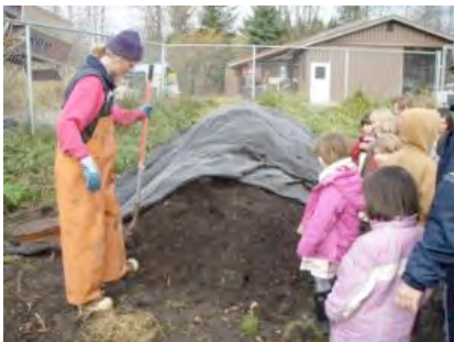
A school tour of the compost

“DRC”. They place a big emphasis on managing their wastes as environmentally sound as possible.