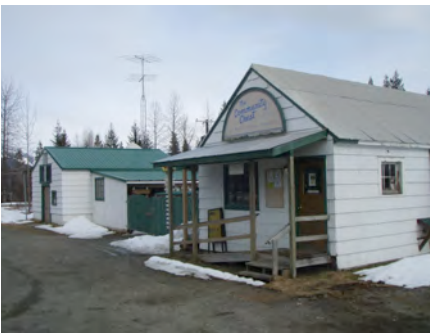
The Community Chest

Gustavus also has a full-service used materials/thrift store called the Community Chest. The DRC manages the store, and community volunteers run the store. They accept all sorts of used items – nearly anything that can be reused and safely handled by the store. This includes clothes, books, toys, bikes, lumber, construction items, pipes, windows, paints, etc. The