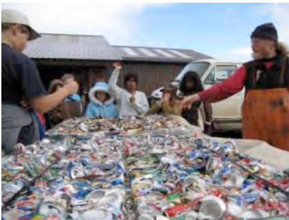
School tour of recycling facility

In winter, the food waste sits in two static piles inside the Quonset hut. The waste composts slower than in the summer but only 350 pounds of food waste are brought in each week, so there is plenty of room for the operation.