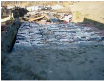
The trash bales in place.