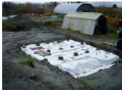
Balefill with cover over it.

To encourage people to separate their recyclables Gustavus has a fee structure based on weight and type of waste. The lowest rate is charged for recyclables, a higher rate for non-recyclables, and the highest rate for "mixed" waste where there is no separation of recyclables. The biggest expense for DRC is personnel and they also pay out around $10,000 to backhaul recyclables. They maintain insurance as well. But with the fees it charges for food wastes, recycling, and trash, and the profits it makes from compost sales and Community Chest store sales, Gustavus only needs the City to contribute about 17% of its budget— about $11,500