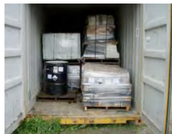
Connex of recyclables ready to ship

Getting the right blend of customer and operator involvement is important in keeping everyone happy. You do not want to "overload" the operator or the public with responsibilities. And he says to remember to be patient with your customers because it can be a steep learning curve