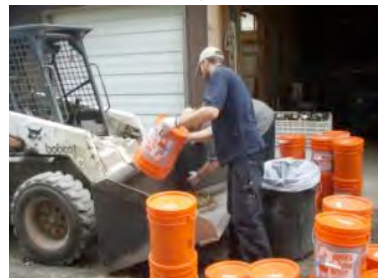
Putting food scraps in the bobcat

One of the beauties of the composting program is that food waste is being diverted from the landfill. Composting also helps keep the baling facility clean. Gustavus uses a trash baler and when food is compacted the baler produces what Paul lovingly calls “baler goo”. This goo is the liquid that is squished out of the food and it creates a smelly mess for the operator. So composting makes the operator’s job much