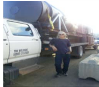
Chris waits to load up the Northland Barge.

Chris also brought down to the barge the burnbox that Native Village of Scammon Bay purchased through their