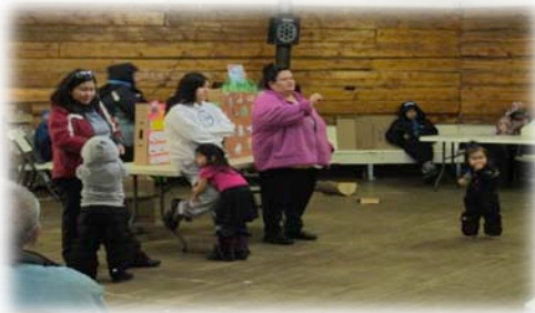
Presenting at a Community Wellness Event

$21,743.00 to carry out their proposed project. Huslia's approach of public education, and locally-built, lower-cost community bins demonstrates how a more affordable trash collection program can be achieved, and how it can reduce poor in-town practices such as barrel burning. Interested? Read on!