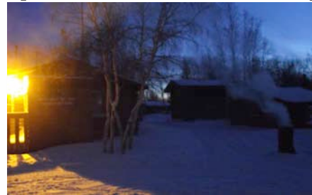
Barrel Burning In Town

Using a shared community bins system, versus house-to-house collection, reduces the labor and operational costs for a collection program. The