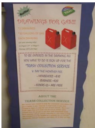
Monthly Raffle Poster to Encourage Signup.