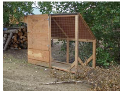
Above: Constructing Bins and Below: Completed Trash Bin

Local hire for locally built trash bins: