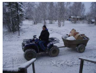
Dedicated ATV and Trailer Purchased with CEDP Award

Post-Project Update: We have an even better post-project update! It's been one and one-half years since their project started, and six months since it ended. The continued anti-burning education-- together with