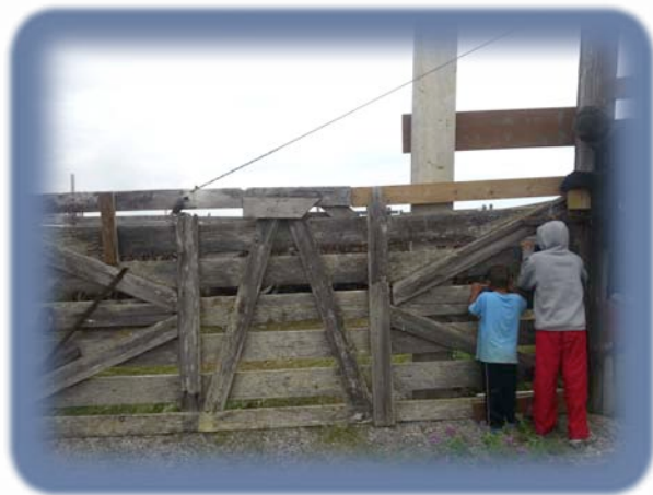
Watching the Reindeer Herd After a Successful Corral On Norton Sound

Hi everyone! Once again, this Fall we're looking at no snow across a lot of Alaska. Unlike last year, temperatures are warm, not cold. It is allowing a lot more work on construction and other projects - many of which had to start late this year due to the late snow. Living in rural Alaska villages means to always be prepared, and to be prepared even for times that give you more time to prepare! Now that barge season is gone for nearly all of us, are you looking for a project to start while waiting for more snow and a hard freeze-up? We hope this issue gives you some ideas. We