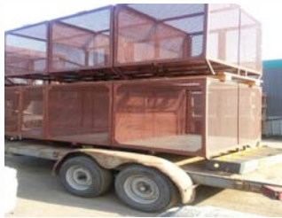
Trash bins on their way from Tok

Hooper Bay was awarded a grant to start a community trash collection program from RurALCAP's new Solid Waste Management grant program for YK Delta villages.