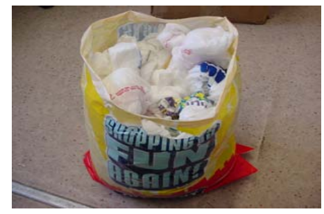
A bag of shopping bags collected and brought to our Environmental Department

We, here at the Chevak T.C. Environmental Department, collect plastic bags for a crocheting program for the students or community. We would like to start this program as soon as we have enough or more than enough plastic bags to start with. When you bring a bag of shopping bags for recycle, you will be eligible for the monthly drawing for recyclers.